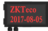
LPR-Display Screen (Optional)